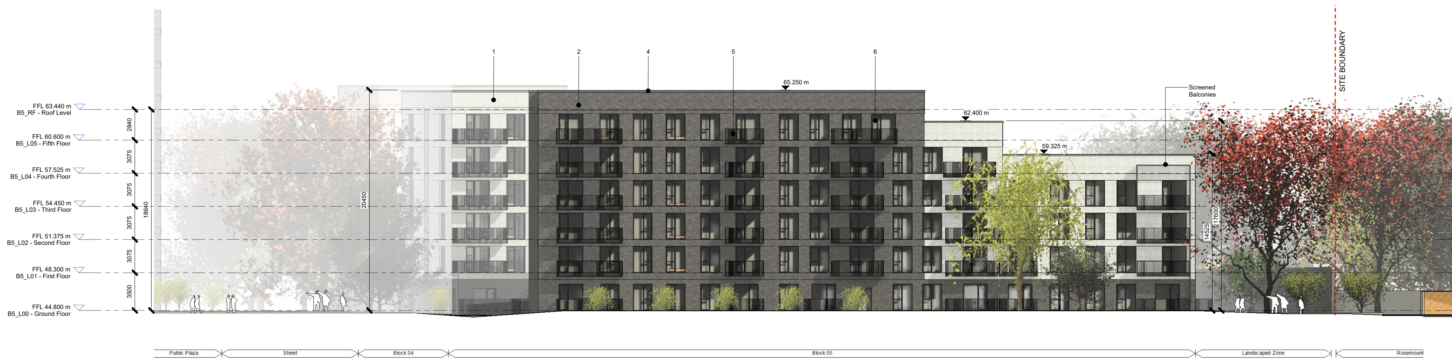
Block 05, West Elevation 1 : 200

Notes: - Do not scale from this drawing. Use figured dimensions in all cases. - Verify dimensions on site and report any discrepancies to the Architect immediately. - This drawing is to be read in conjunction with the Architect's Specification. - © This drawing is copyright and may only be reproduced with the Architect's permission.