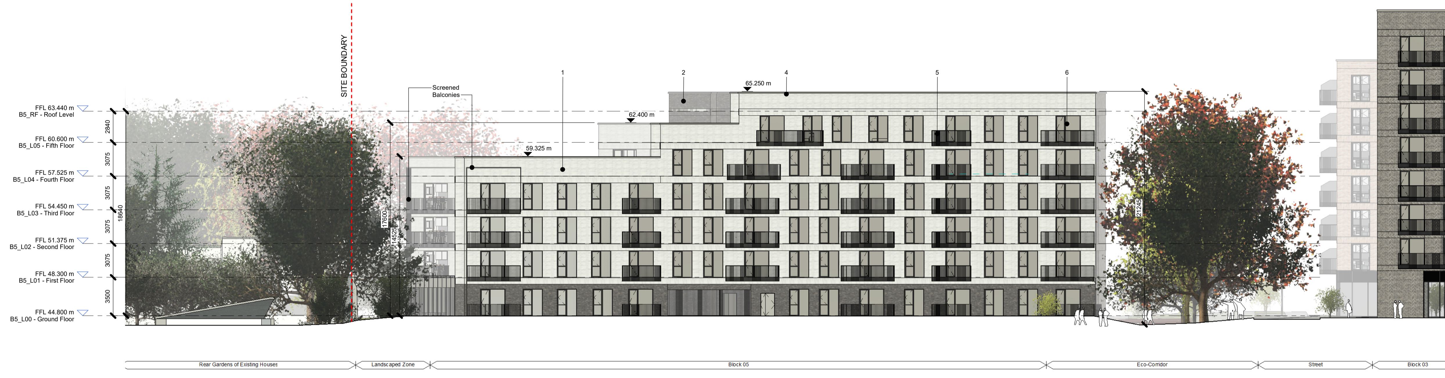
Block 05, East Elevation 1 : 200